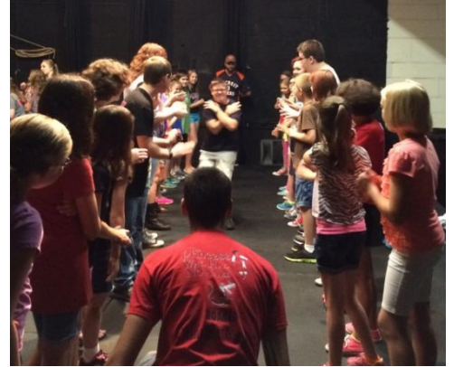
Summer Theater 2014

Summer Theater has become a staple of childhood for Portland's young people, and we look forward to this tradition thriving for many years to come. If you participated, be sure you tell your friends in school how much fun it was and encourage them to join you next summer.